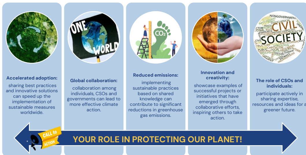
Figure 6: Practical Measures for Environmental Action

Communicating environmental and green measures to disengaged people can be a challenge, but communication can be tailored to highlight the direct impact of climate change on individual lives, presenting simple actions they can take and from which they can benefit. For example, community-supported agriculture programs not only support the environment by promoting sustainable practices, but also benefit individuals by providing them with fresh, locally sourced products. A different example could be carpooling, where individuals share rides to the city, as it can significantly reduce carbon emissions and traffic congestion while offering a cost-effective way for commuters to travel. Finally, installing solar panels not only benefits the environment by reducing reliance on fossil fuels, but also lowers energy bills for homeowners, offering long-term financial savings.