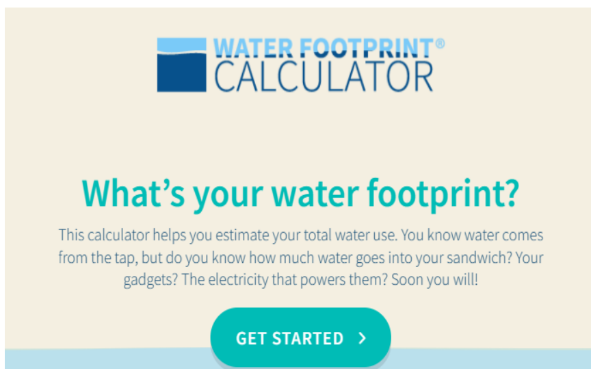
Figure 4: Water Footprint Calculator

The scientific evidence is clear: the climate is changing and will continue to change, affecting societies mainly through water. The global climate crisis is inextricably linked to water. Climate change increases variability in the water cycle, inducing extreme weather events (heavier rainfall, heat, prolonged droughts), reducing the predictability of water availability, affecting water quality and threatening sustainable development, biodiversity and the enjoyment of the human rights to water and sanitation worldwide.