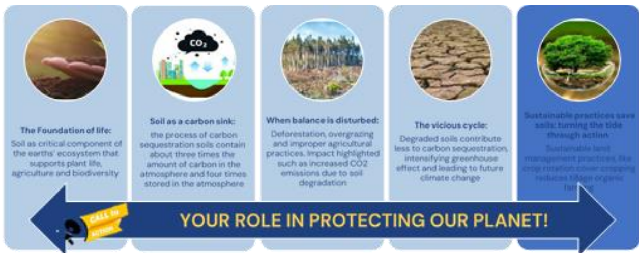
Figure 5: Soil

Healthy soils absorb carbon from the atmosphere, helping to mitigate the effects of climate change. Conversely, poor soil management can release stored carbon back into the atmosphere, exacerbating global warming.