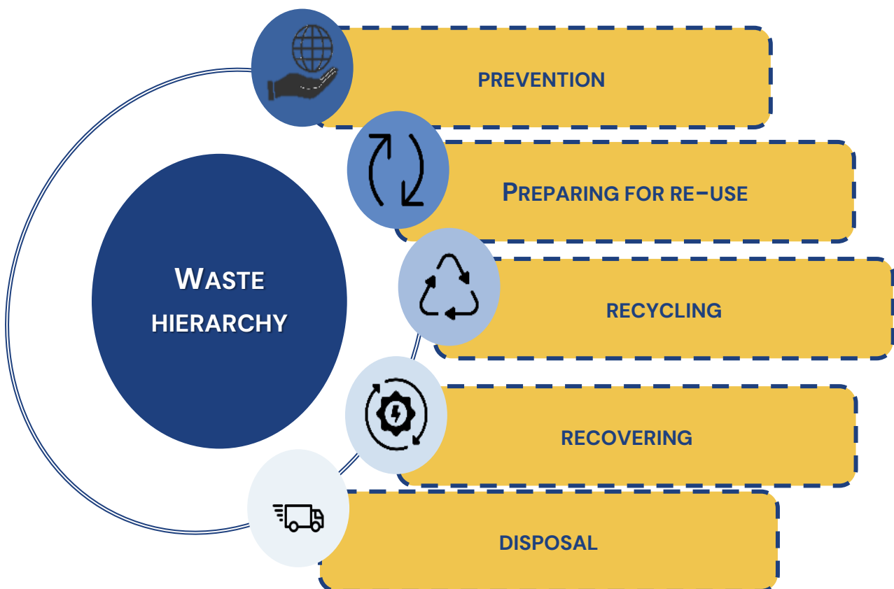
Figure 1: Waste Pyramid

The Waste Framework Directive outlines basic waste management concepts, definitions and principles. It requires that waste be managed without endangering human health and harming the environment without risk to water, air, soil, plants or animals without causing a nuisance through noise or odours and without adversely affecting the countryside or places of special interest. It explains when waste ceases to be waste and becomes a secondary raw material, and how to distinguish between waste and by-products. The Directive also introduces the "polluter pays principle" and the "extended producer responsibility". The foundation of EU waste management is the five-step "waste hierarchy", established in the Waste Framework Directive. It establishes an order of preference for managing and disposing of waste.